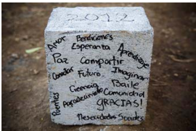
At the beginning of the build week, volunteers were asked to write on a cement block one word that best expressed their reason for making the trip.

"Once they understand shelter issues on a very deep, personal level, they are energized to do whatever they can to change all the policies that trap people in poverty housing."